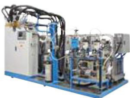
4-component machine with color/additive dosing