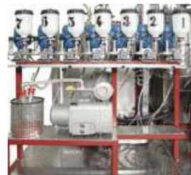
Color or additive dosing