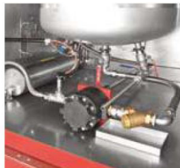
Coreolis flow rate measurement